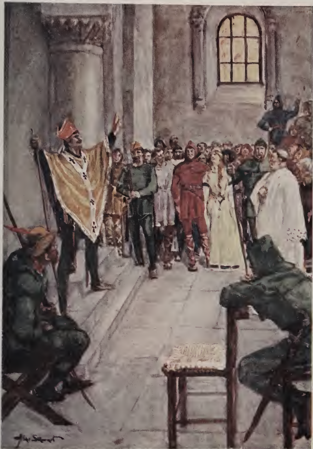
THE WEDDING OF ALLAN-A-DALE.